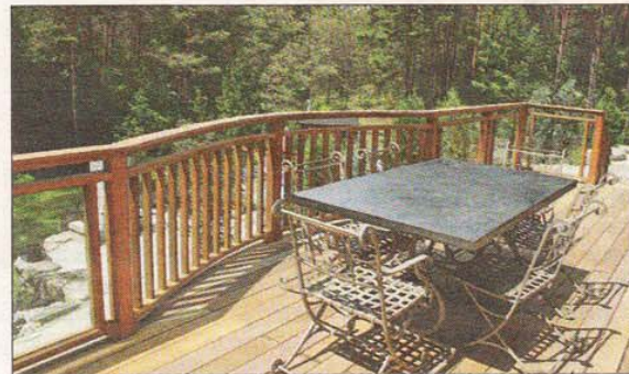
A Toronto-area deck built by Delta Decks out of Ipe wood. See www.deltadecks.com for more information.

Simple decks in squares or rectangles are most popular right now — a modern, minimalist look is